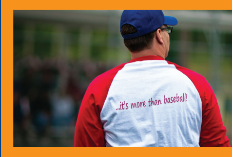
"This is the best part of my week."

By the fall of 2008, The Miracle League had added two leagues to its lineup: the Competitive League, for players who had played in the Original League for at least one season and understood the rules of baseball, and the Adult League, for players 19 years and older. In the six seasons The Miracle League of Arkansas has been open to participants, we have grown to include more than 375 kids in our Original, Competitive and Adult leagues.